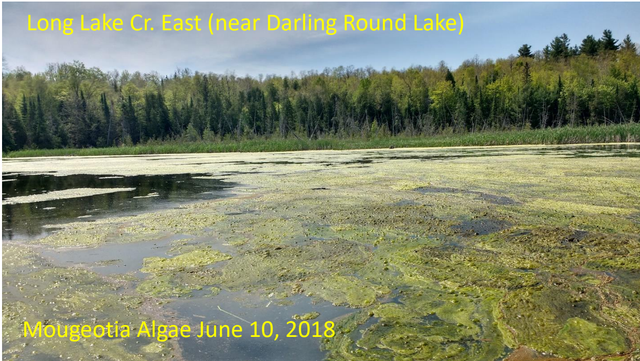
Mougeotia Algae June 10, 2018

The second bloom occurred near Sunset Bay extending in patches for about 1 km from the boat launch. The bloom was most intense near the estuary of Boundary Creek. It was evident that wind and wave action were in the process of dissipating the floating masses of algae when it was observed.