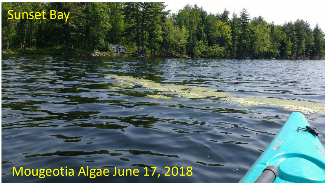
Mougeotia Algae June 17, 2018