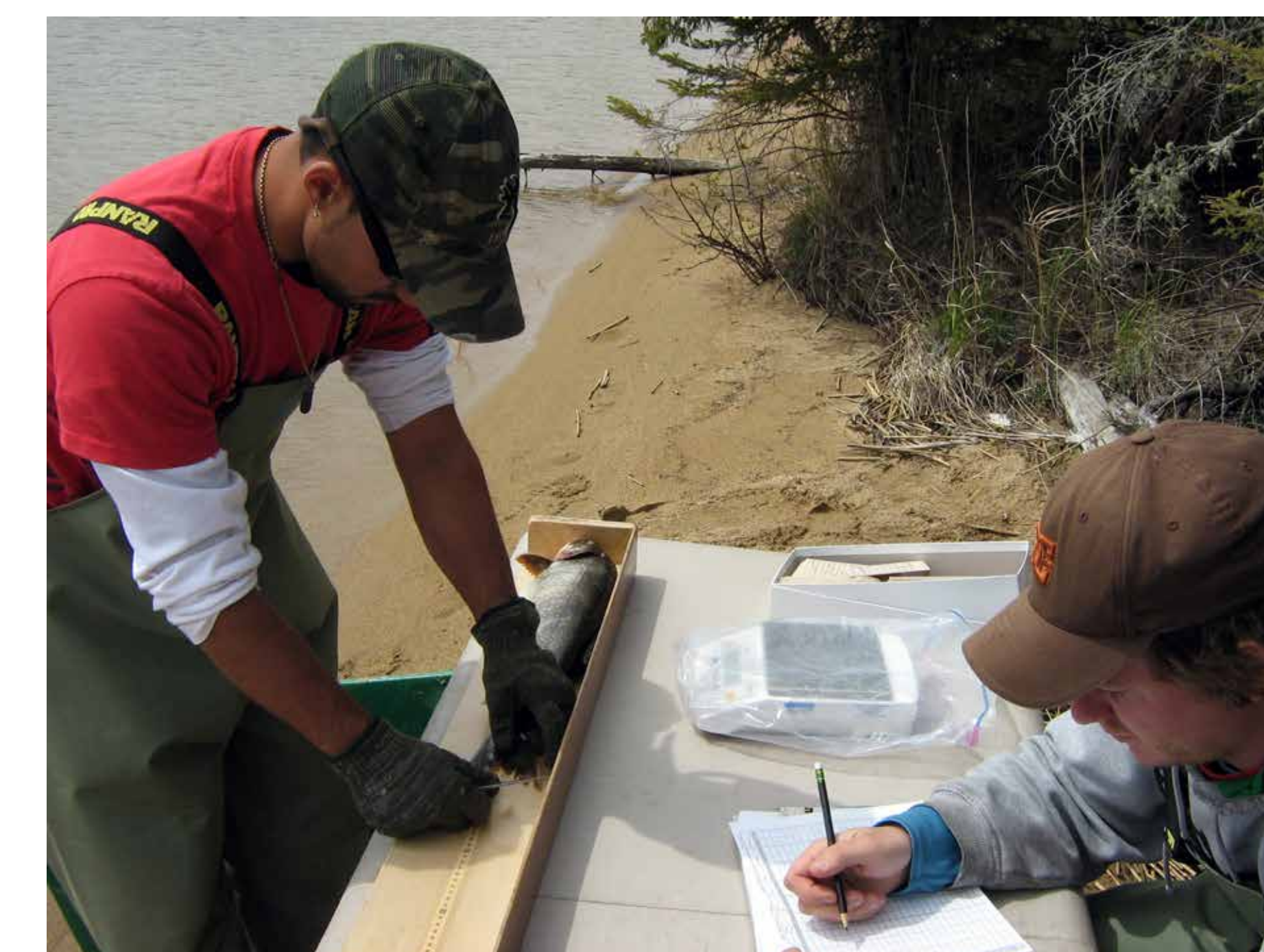
A crew measuring and recording fish length and weight (as well as other characteristics not shown).