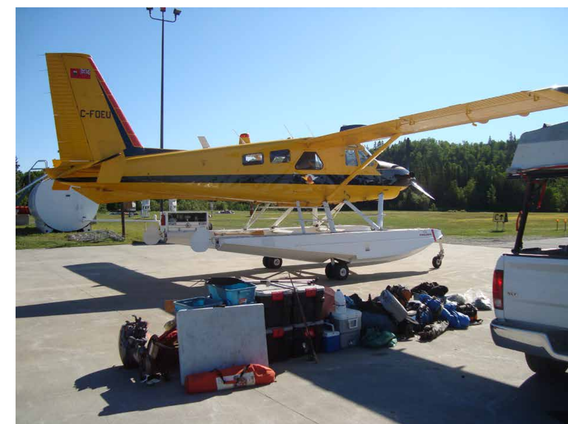
A crew getting equipment ready to fly into a lake. In addition, aerial surveys are flown over selected lakes during the summer, and sometimes again in the winter. The total estimated angling pressure is calculated for each zone.

Certain lakes are examined for invasive species like spiny waterflea and rusty crayfish. Invasive species were found in a number of additional lakes in the first cycle.