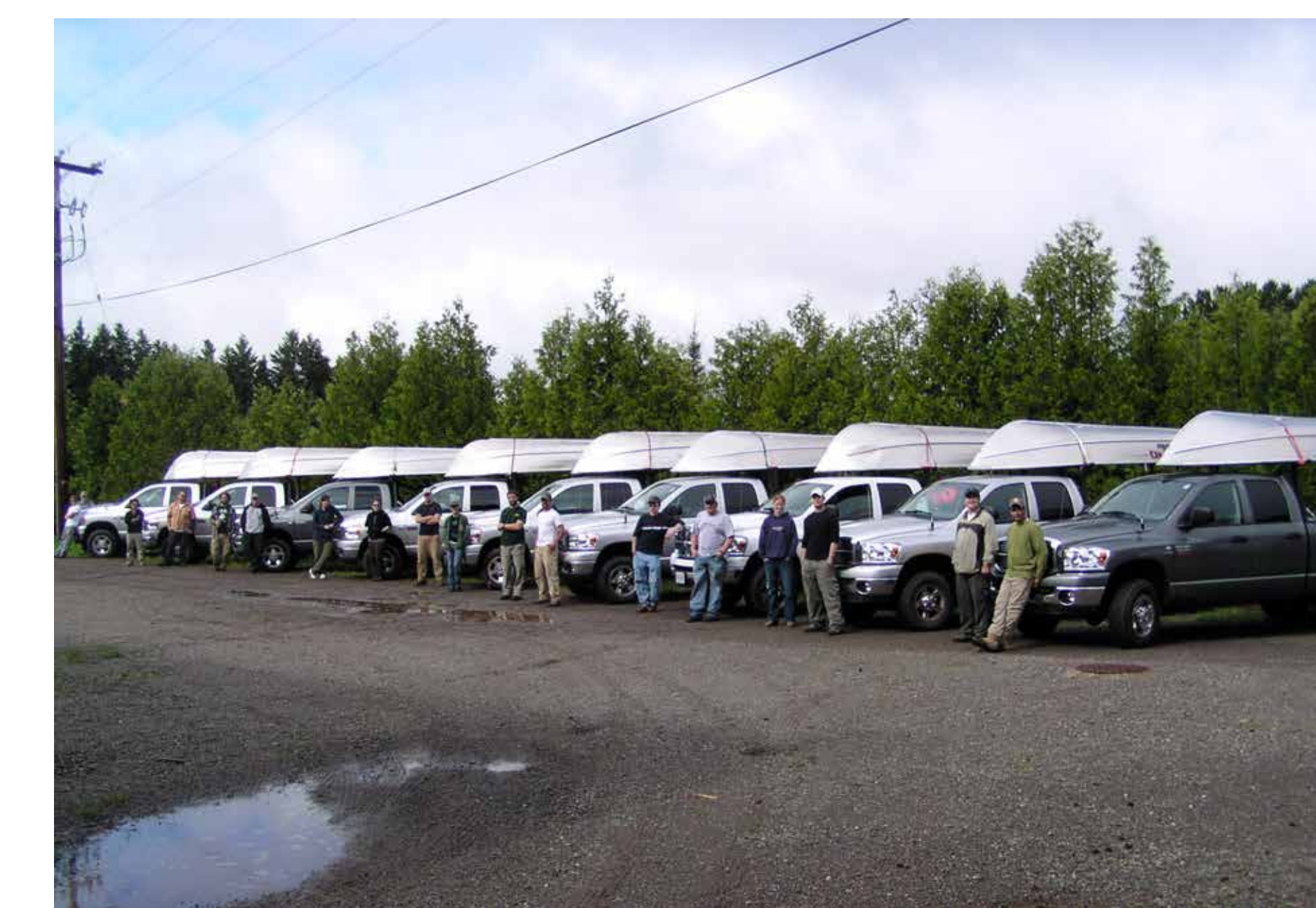
Broad-scale crews preparing to begin last summer's lake survey work. Most inland lakes can be reached by road or an ATV, but many remote inland lakes require flying in.

For more information on the broad-scale program, contact: