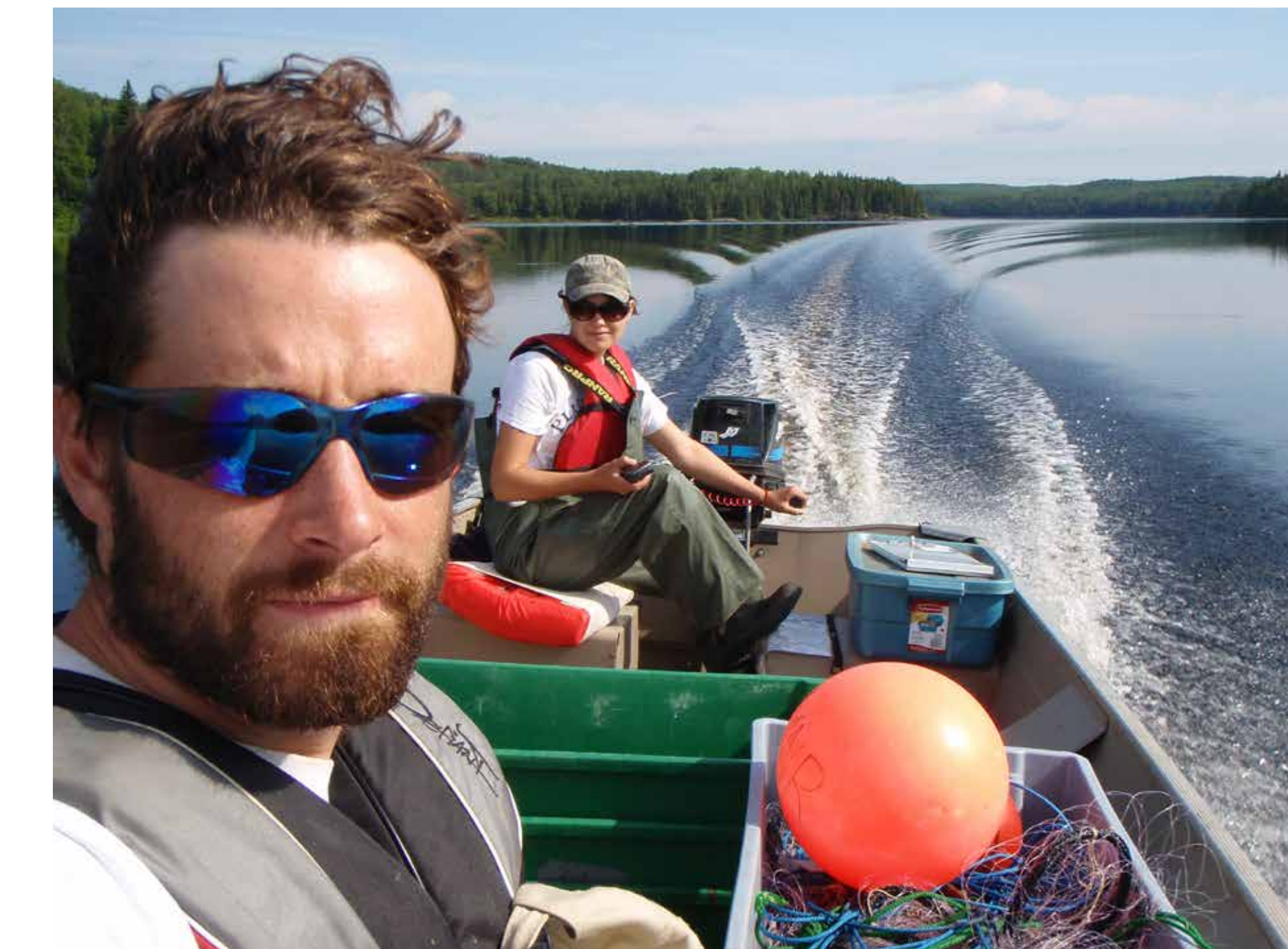
Science staff working for the broad-scale fisheries monitoring program across Ontario include postsecondary students. They spend their summer conducting fieldwork travelling from lake to lake netting and sampling fish. They are helping Ontario to put science to work managing our fisheries more effectively.