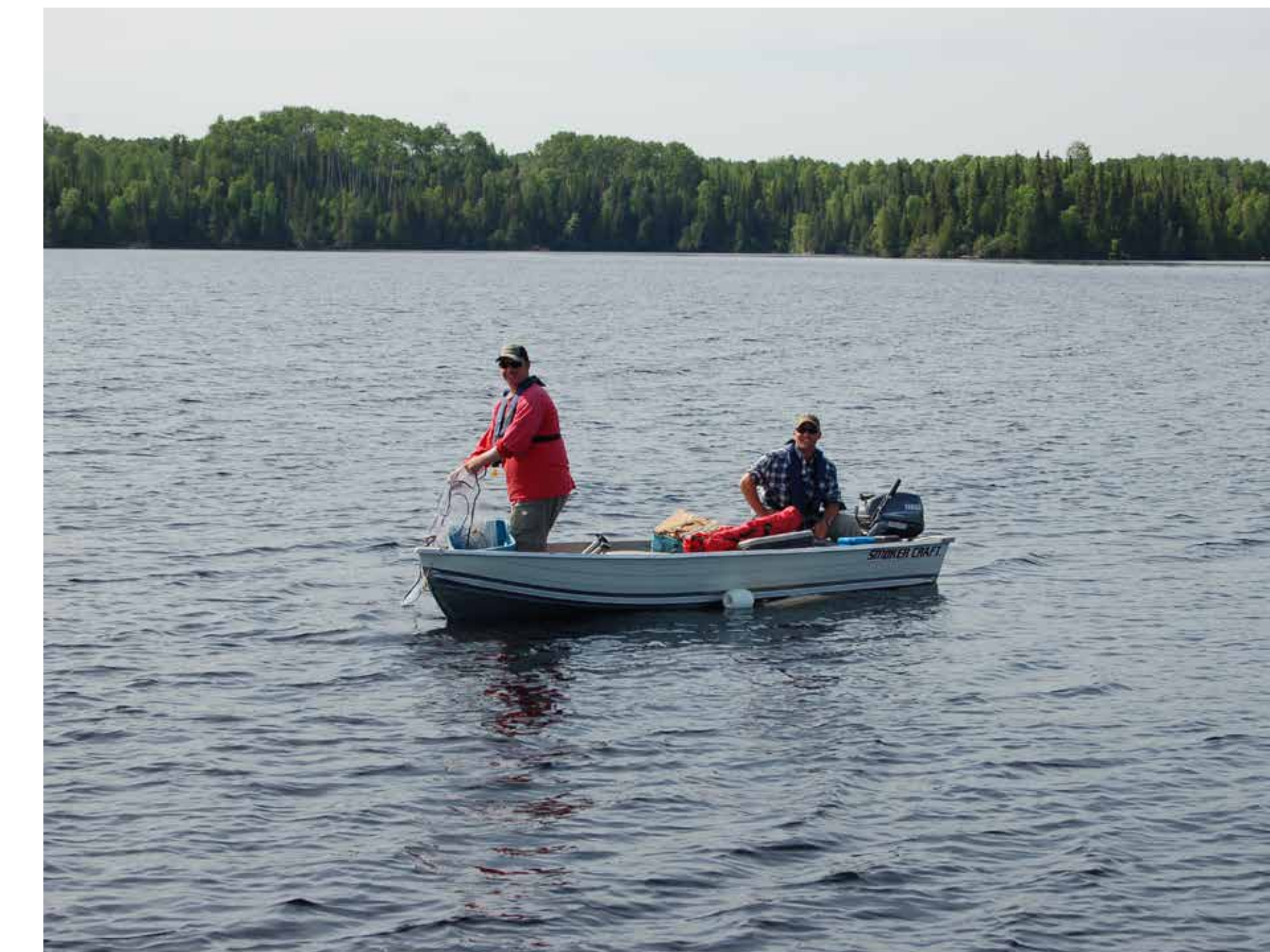
An MNR science crew pulling in a gill net during a lake survey. Each lake is surveyed with two types of nets: large mesh that captures game fish, and small mesh that captures forage fish. The relative density (fish/net) of each species is calculated by lake and compared with other lakes in the zone.