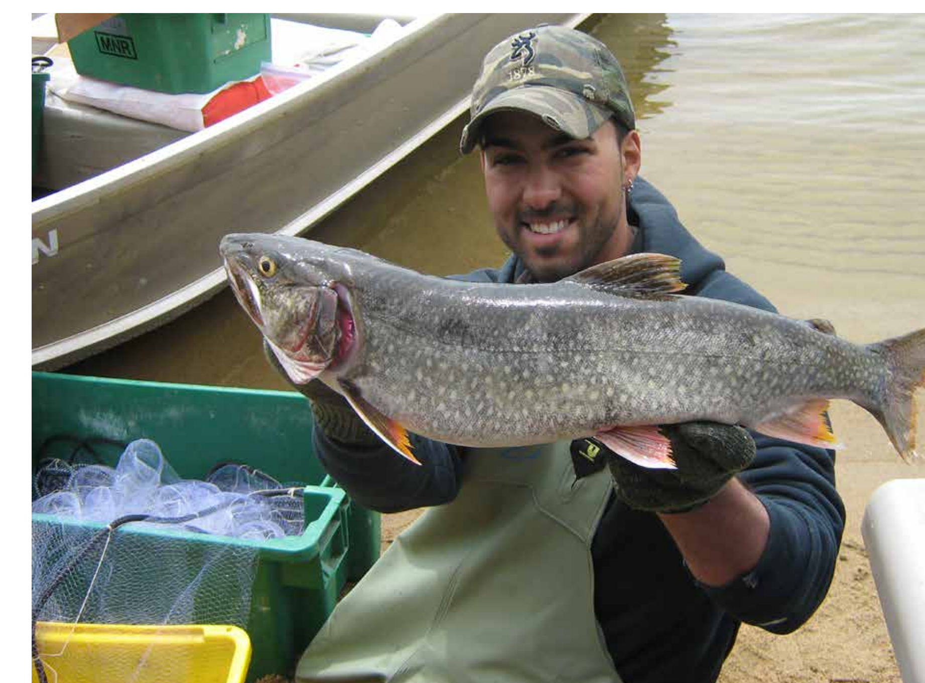
Fish caught include lake trout, brook trout, walleye, northern pike, common white suckers, yellow perch, rock bass, redhorse sucker, whitefish, cisco, emerald shiner, spottail shiner, mimic shiner, and trout-perch.