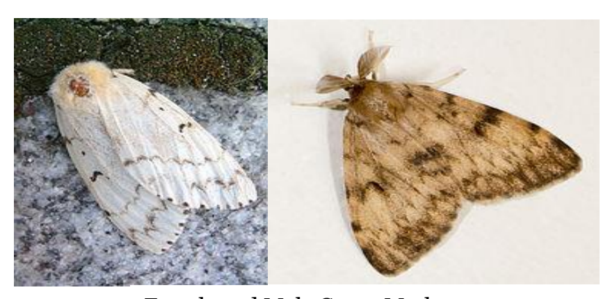
Female and Male Gypsy Moths

Suggestion: If you are planning to implement any of the measures outlined above, be sure to buy your supplies early to avoid disappointment.