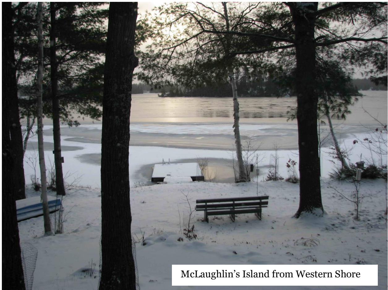
McLaughlin's Island from Western Shore

So, we have the peculiar properties of water to thank for our very existence and for ice fishing as well!