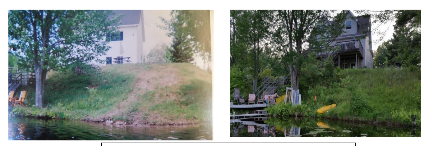
Before and After Shoreline Restoration

7. How does phosphorous get into the lake from septic systems? Domestic septic systems do not filter out phosphorous, not even the most modern systems. Phosphorous migrates from septic systems to lakes. The amount and the time it takes varies according to: