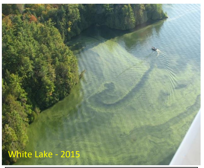
Typical of blue-green algae blooms on White Lake

3. When is a lake at capacity? A lake is at capacity when there is a deterioration in water quality as evidenced by: